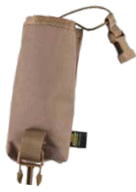
• For Tactical Radios HR9-6542 Large Retrac Holster Coyote Holster: 2 5/8" x 1 1/2" x 7", MOLLE Mount Retractor: Force; 9 oz. Extension: 32"