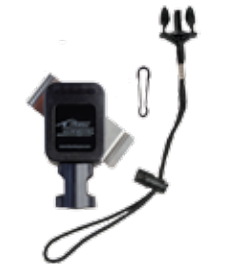
RT2-5550-E SS Rotating Belt Clip: Interlocking attachment to gun belts up to 2.25" Easy to install or remove