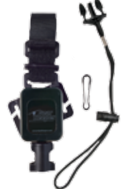
RT4-5570 Combo MOLLE Mount

Combo Mount includes two mounting systems in one! Velcro Strap Mount: Loops & cinches around gun belts or to MOLLE Rotating MOLLE Mount: Clips to MOLLE - Rotates 360 degrees Ideal for chest-mount holsters