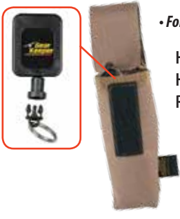
• For Laser Pointers, Tactical Flashlights HR9-0541 Retractable Flash Holster Coyote Holster: 1 1/4" x 1 1/4" x 5", MOLLE Mount Retractor: Force; 6 oz. Extension: 36"

Integrated System is Compact, Quiet & Secure Holster provides secure storage for your gear while hiking Integrated retractor prevents loss or damage