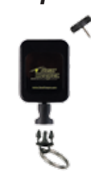
• Threaded Stud Mount RT4-0020 Force: 3 oz. Ext : 36" RT4-0021 Force: 6 oz. Ext : 36" RT4-0024 Force: 9 oz. Ext : 32"