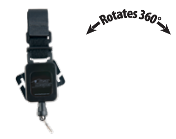
RT4-5170 Force:3 oz Ext: 36" RT4-5171 Force: 6 oz Ext: 36" RT4-5174 Force:9 oz Ext: 32"