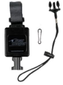
RT3-5533 Velcro Strap Mount: The most common version Loops & cinches around gun belts or to MOLLE

Will suspend firearm—stabilization force while aiming Recommended for short duration use