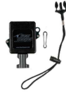
RT3-5563 Rotating Clamp-On: Assembles to gun belts up to 2.25". Very secure con- nection; will not dislodge