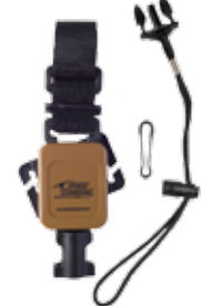
RT4-5570-C Combo MOLLE Mount Coyote

Combo Mount includes two mounting systems in one! Velcro Strap Mount: Loops & cinches around gun belts or to MOLLE Rotating MOLLE Mount: Clips to MOLLE - Rotates 360 degrees Ideal for chest-mount holsters