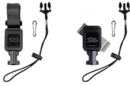
RT2-5530-A Velcro Strap Mount: The most common version Loops & cinches around gun belts or to MOLLE

No resistance on firearm—acts as safety tether. Recommended when firearm is extended for long periods