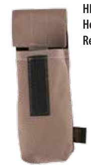
• For GPS Units, Small Electronic Devices HR9-4542 Medium Retrac Holster Coyote Holster: 2 1/4" x 1 1/2" x 5 1/2", MOLLE Mount Retractor: Force; 9 oz. Extension: 32"