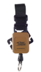
RT4-5170-C Force:3 oz Ext: 36" RT4-5171-C Force: 6 oz Ext: 36" RT4-5174-C Force:9 oz Ext: 32" Coyote