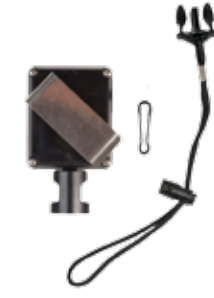
RT3-5553-E SS Rotating Belt Clip: Interlocking attachment to gun belts up to 2.25" Easy to install or remove