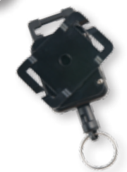
360° Rotating MOLLE Mount ACO-2018 Adapt to any RT2 or RT4 Gear Keeper