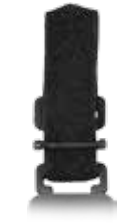
Velcro Strap Mount ACO-0304