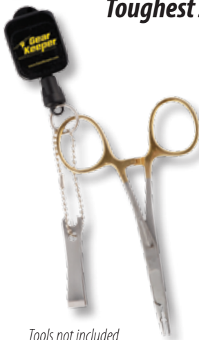
Tools not included

Toughest Zinger on the market... Protect your expensive tools! Hefty 40 pound break strength